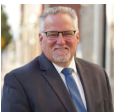
Mayor Scott Long City of Wabash